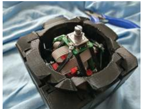
Digital Rubik Cube illustrates the real and the virtual world together, the communications potential of 5G networks and the related engineering challenges